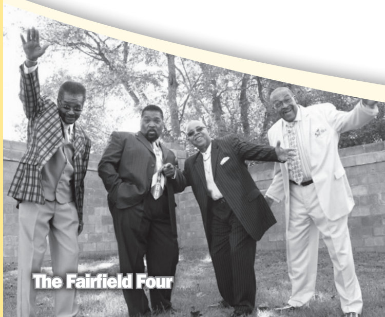
The Fairfield Four

Direct any questions or requests for special needs to the office at Wheatland Music Organization (Monday-Friday 8am-4pm) at 989.967.8879.