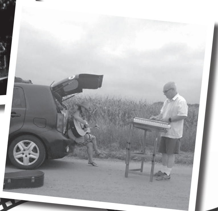
Mixing it up at Main Stage