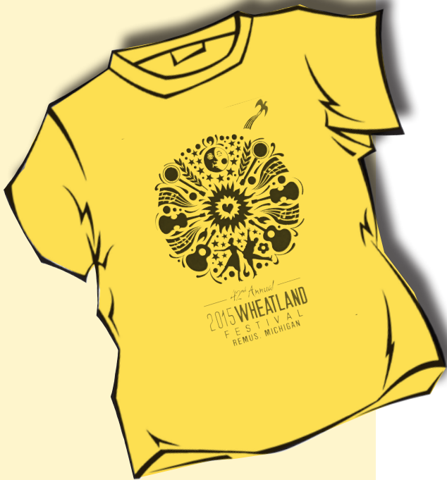
2015 T-Shirt Design by Robert Schewe

Volunteer Orientation is AUGUST 8TH CLASSROOM BUILDING 9AM